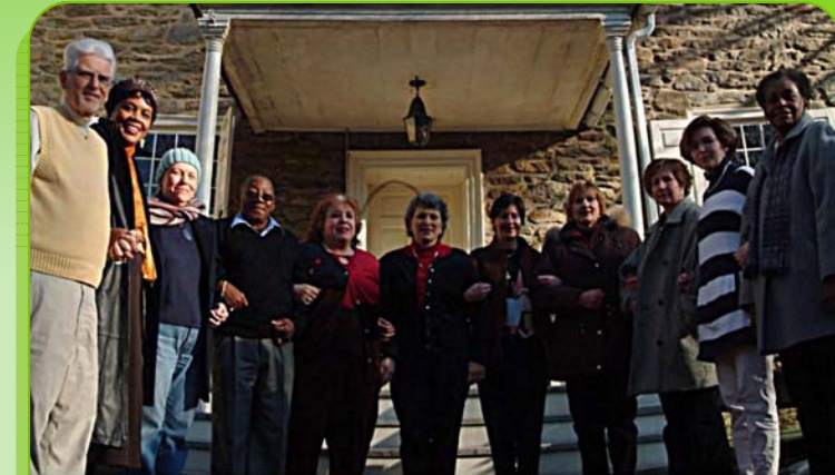
"Wellness Center Participants and Staff"

The Wellness Community of Philadelphia (which started on City Avenue) has lots of fun stuff planned in celebration of its 15th Anniversary. Located in West Fairmount Park, the Wellness Community of Philadelphia (TWCP) offers free programs of support, education and hope for people with cancer and their families.